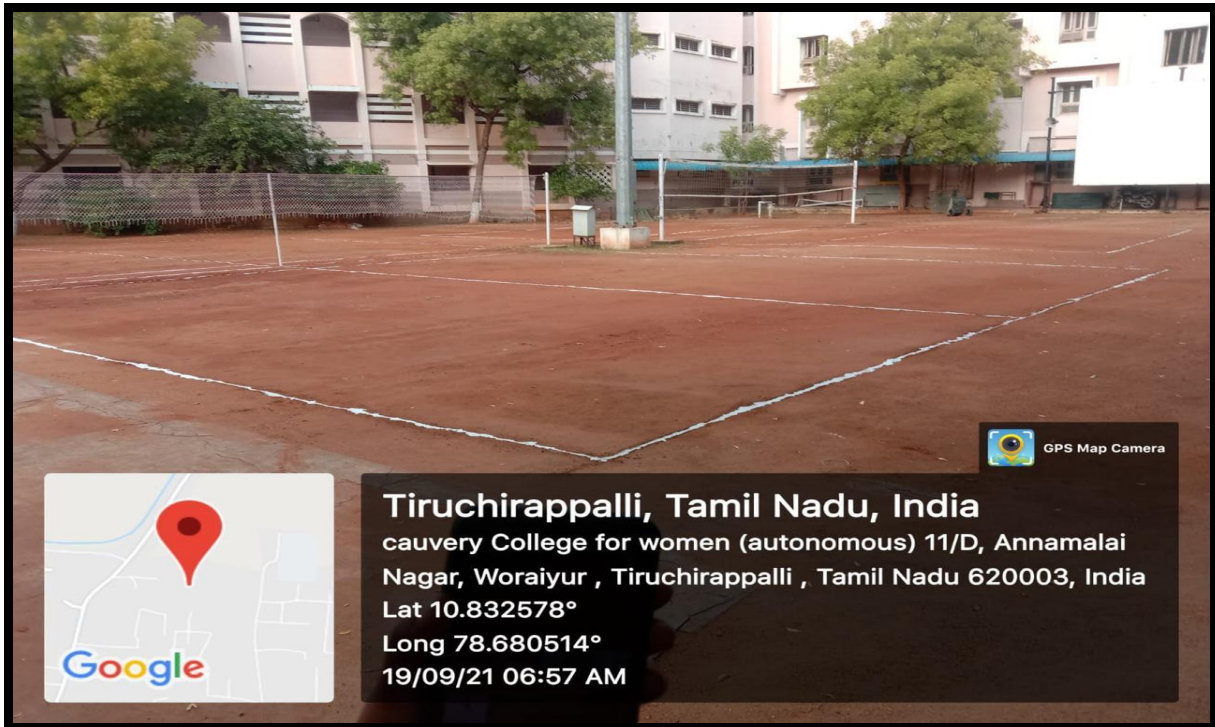
BALL BADMINTON COURT